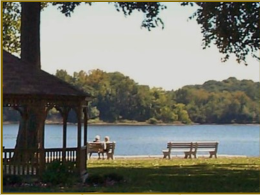
Park benches along the river at Henry Hudson Park