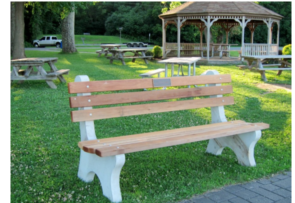
Park bench along the river at Henry Hudson Park

In accordance with Town specifications, park benches are 6 feet long with concrete sides and wooden slats.