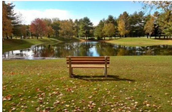
Park bench at Elm Avenue Park

In a public park for all to enjoy for years to come!